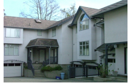
Sold in 3 Days! 657 Cornwall Street

3546 Redwood Avenue 2632 Pinnacle Street T505- 66/68 Songhees Road Lot A - Foul Bay Road 1039 Foul Bay Road 3316 Keats Street #303 - 1148 Goodwin Street #301 - 1217 Pandora Avenue #404 - 1061 Fort Street 3300 Maryanne Crescent 3103 Antrobus Crescent 751 Fairfield Road 2022 Haultain Street #406 - 2119 Oak Bay Avenue #304 - 1100 Union Street #306 - 1217 Pandora Avenue #1102 - 160 Wilson Street #712 - 160 Wilson Street 3375 Billhurst Place 4026 South Valley Drive 4248 Kincaid Street #8 - 1717 Blair Avenue