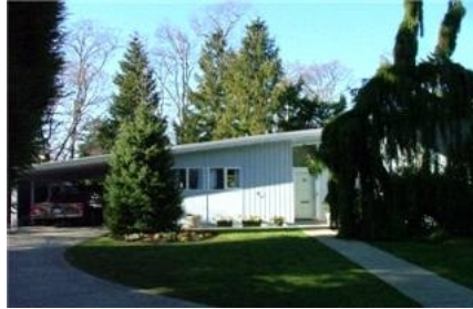
Sold in 2 Days! 3552 Henderson Road