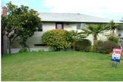
Sold in 1 Day! 1662 Donnelly Road