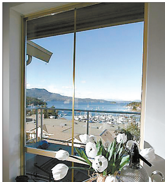
Left: The view from the dining room window reaches out to the Malahat.