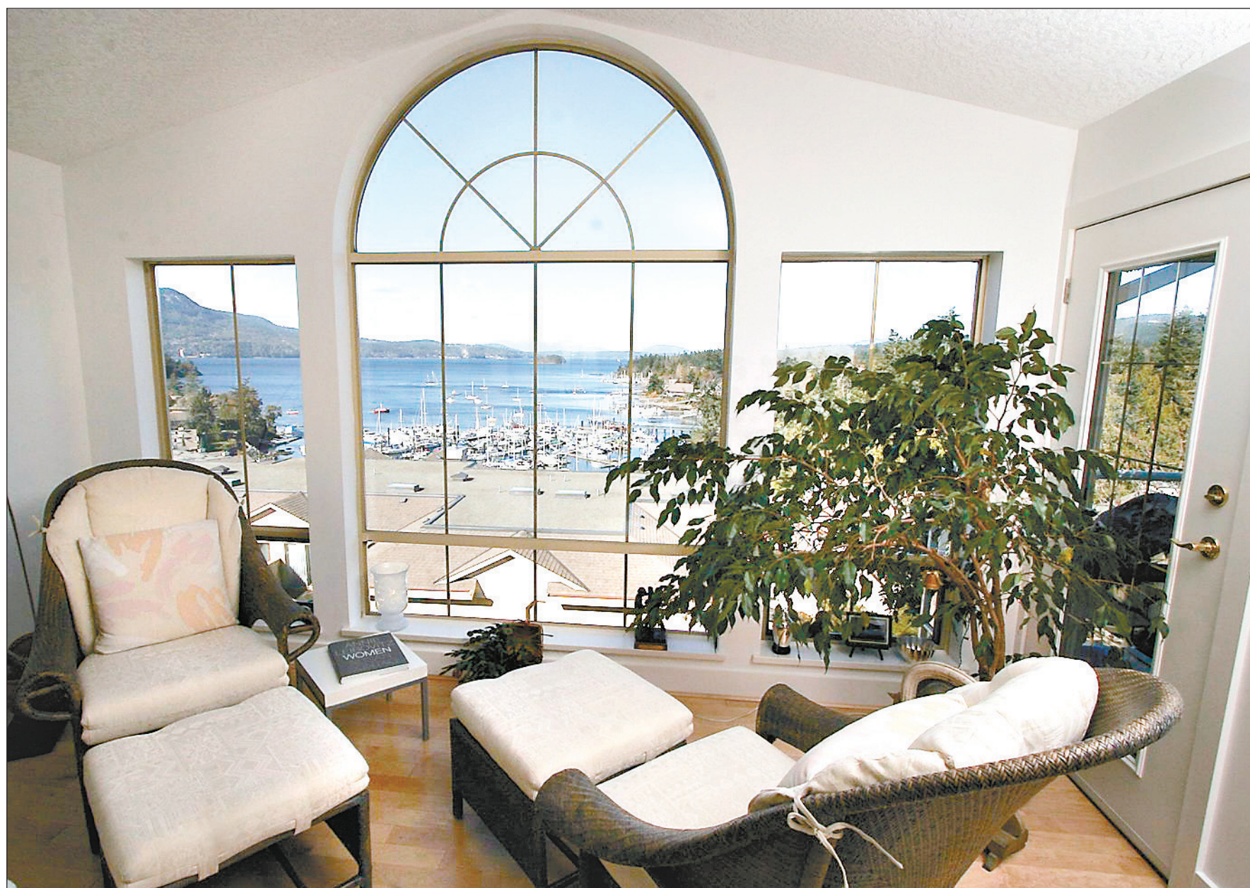
A Palladian window — a large, arched window flanked by two rectangular side lights — in the Chapples' living room looks out at a marina.

Editor: Angela Mangiacasale • Telephone: 380-5341 • E-mail: features@tc.canwest.com